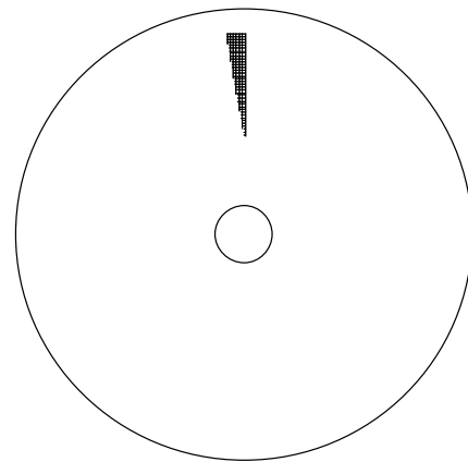
Imaged figure of Scratches (Entrance surface for optical beam)

note) Please be careful not to erase the content from, nor overwrite ABD-RE542.