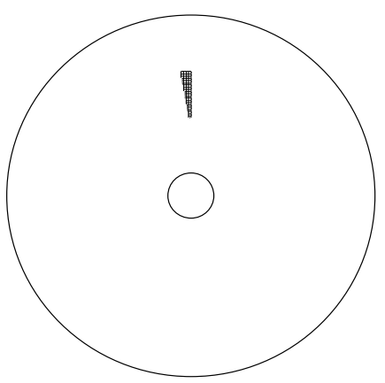
Imaged figure of Scratches (Entrance surface

Effective Chapter No. X Layer 0: No.2,3,4,5,6,7,8